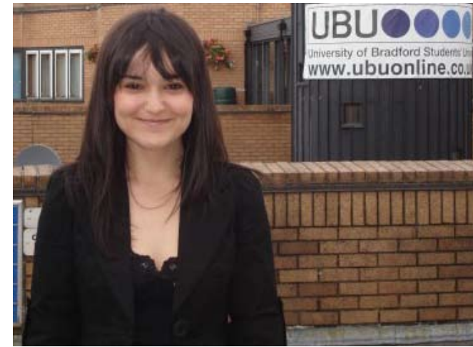
We Will Keep On Campaigning

If there were to be an equal opportunities officer, how could that officer be able to fully represent the wide range of students? To be blunt, how can a man represent women? A heterosexual woman represent a gay man? A white man represent black people? A woman’s officer guarantees a woman representative on union executive and autonomy allows that group to self-organise.